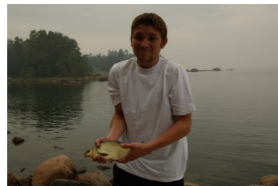
Roach a plenty at our cottage in Finland