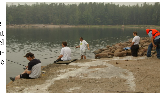
Fishing For Bream By The Cottage In Finland 06

All the stolen goods from our cottage in Finland have now been replaced and we thank those of you who specifically donated to that project. In addition we have purchased, sited and adapted a steel shipping container at the cottage, which should keep our most valuable assets safe and sound. Along with extra security measures on the cottage itself, we feel much more comfortable.