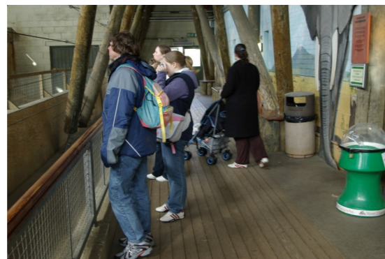
A Day at the Zoo: Staff, Young Mums and Babies