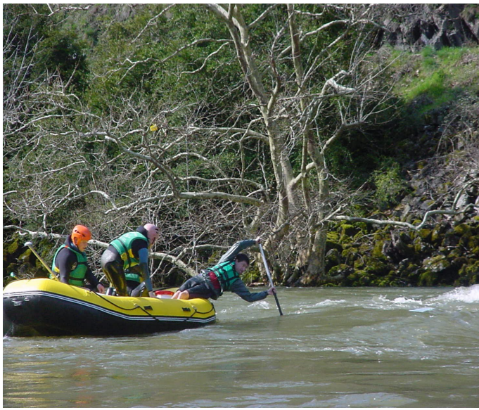
White-water Rafting Down The River Lot in France, March 2006

The youngsters learned a lot from their 'working parties'. It really emphasises how as a nation we are miseducating our youngsters. We have become so full of political correctness, guidelines and good practice that when it comes to the care and education of our young we have become guilty of neglect. We give the youngsters a false impression of what life is like. They have expectations beyond reality. They do not know how to do as they are asked, they believe everyone has a responsibility to them. They expect to start work on £40,000 a year, not to be ordered about, not to have to do anything they don't want. A huge chunk of our time as a Charity is spent educating the 16+ age group into what real life is all about. Some of our youngsters are unemployable when they leave school, not because they are stupid but because they do not know how to behave and what is reasonable to expect. Adults involved in young peoples lives are frightened to give the youngsters clear guidelines and parameters to work to; to teach them values and morals, to prepare them for real life. Common sense has disappeared almost altogether. Second Chance continues to do its best in re-dressing the balance.