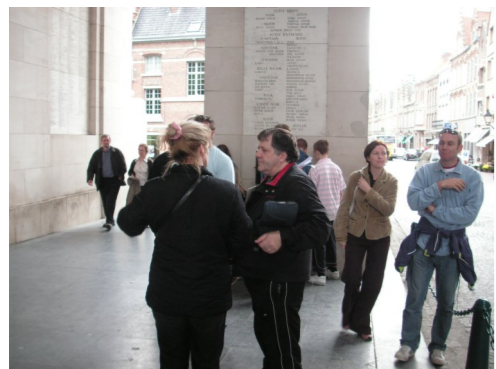
Battle Fields and The Menin Gate at Ypres was an education for the youngsters