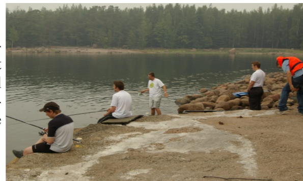
Fishing For Bream By The Cottage In Finland 06

All the stolen goods from our cottage in Finland have now been replaced and we thank those of you who specifically donated to that project. In addition we have purchased, sited and adapted a steel shipping container at the cottage, which should keep our most valuable assets safe and sound. Along with extra security measures on the cottage itself, we feel much more comfortable.