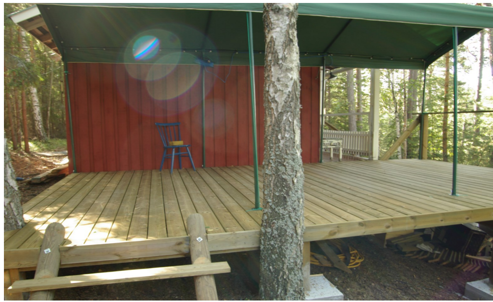
New Veranda Attached To The Cottage in Finland Built July 06