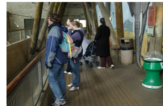
A Day at the Zoo: Staff, Young Mums and Babies