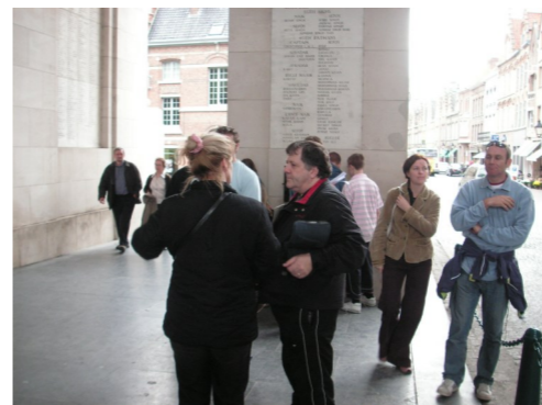
Battle Fields and The Menin Gate at Ypres was an education for the youngsters