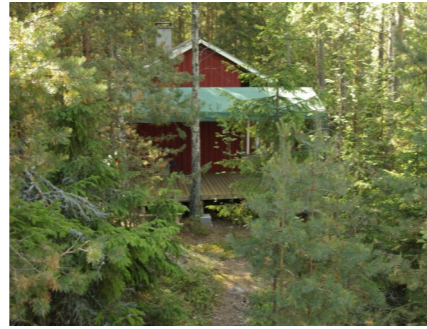
Set deep in the forest beside the Baltic Ocean the cottage is a wilderness experience for inner city children from areas like London, Birmingham and the Medway Towns.