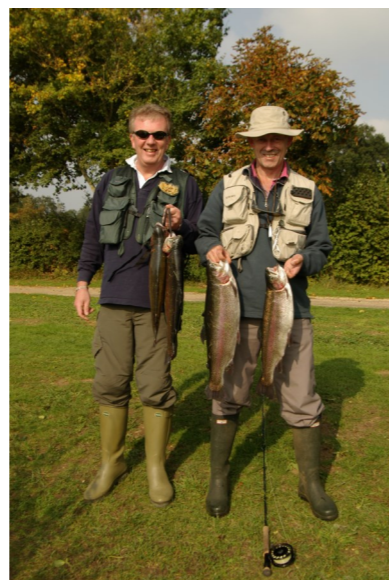
Dever Springs are great days fishing for Supporters and friends of Second Chance