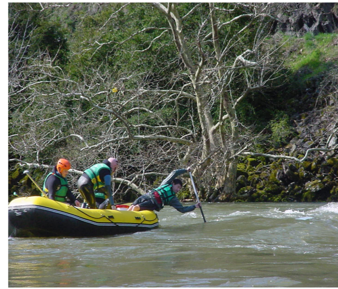
White-water Rafting Down The River Lot in France, March 2006

The youngsters learned a lot from their 'working parties'. It really emphasises how as a nation we are miseducating our youngsters. We have become so full of political correctness, guidelines and good practice that when it comes to the care and education of our young we have become guilty of neglect. We give the youngsters a false impression of what life is like. They have expectations beyond reality. They do not know how to do as they are asked, they believe everyone has a responsibility to them. They expect to start work on £40,000 a year, not to be ordered about, not to have to do anything they don't want. A huge chunk of our time as a Charity is spent educating the 16+ age group into what real life is all about. Some of our youngsters are unemployable when they leave school, not because they are stupid but because they do not know how to behave and what is reasonable to expect. Adults involved in young peoples lives are frightened to give the youngsters clear guidelines and parameters to work to; to teach them values and morals, to prepare them for real life. Common sense has disappeared almost altogether. Second Chance continues to do its best in re-dressing the balance.