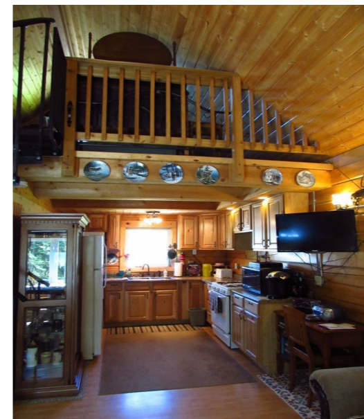
Kitchen below loft one end, Toilets and showers the other end