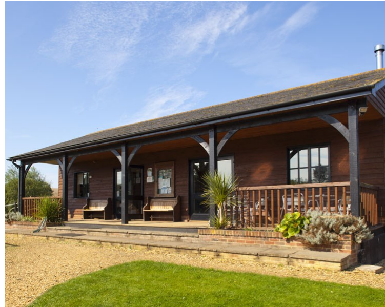
This is the lodge at the Dever Springs Fishery near Andover and in many ways is beginning inspiration for our building

This building will bring about a substantial increase in the number of children accessing our services and facilities. We intend to open up access to other groups who work with similar children. Under our guidance we hope to encourage a new and robust way of working with them, giving confidence to and disseminating good practice to their staff