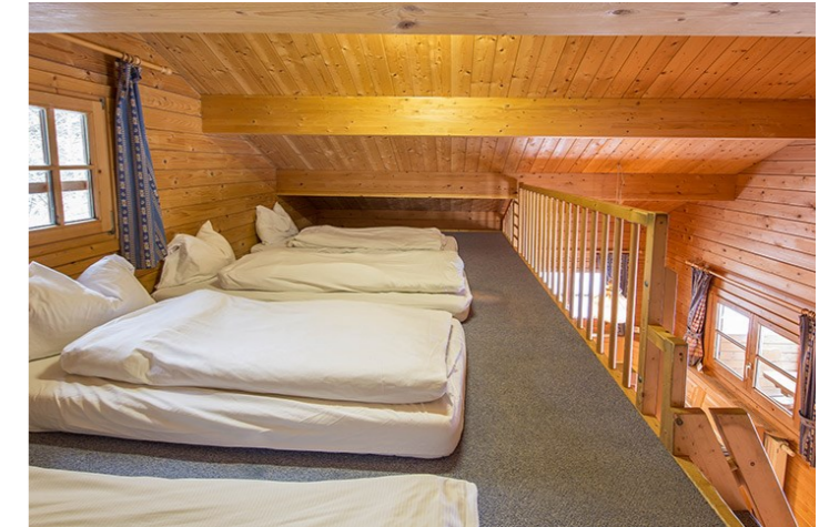
With lofts at either end, similar to this their will be 5 beds at each end to extend residential capabilities from the summer into the winter