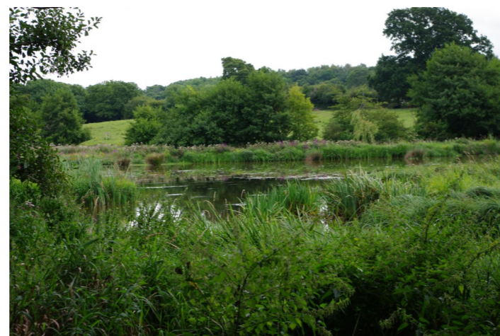
The lodge will sit at the bottom of our nursery site overlooking this our nature reserve.