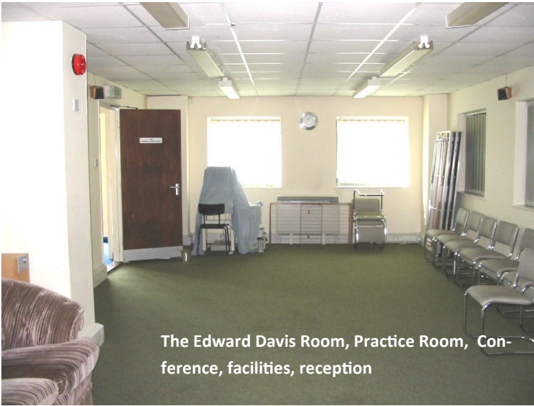
The Edward Davis Room, Practice Room, Conference, facilities, reception

completely disengaged from the system – it’s all about relationships and mentoring. We are just finishing a new storage facility at our Rural Centre so we can empty the basement of the building and convert into the music area with practice rooms and recording equipment etc. The middle floor will have a dance studio and a