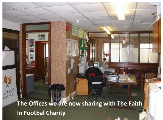
The Offices we are now sharing with The Faith In Football Charity

When we say dance we are thinking of breaking into this via street dancing and similar styles that will appeal more to our youngsters and we hope it may lead to other avenues as well. We have a volunteer who is very much enthused by this prospect. We have volunteers coming to staff the facility from various musical backgrounds not least the Salvation Army local churches. We aim to get the young people into dancing via Street Dancing. There will be opportunity to film and photograph various topics. For want of a better description Drama will feature with a volunteer who is specially qualified in this medium for children who lack confidence it is hoped to also organise visits to theatre and some of the music will be electronic and recorded with an element of DJ. Parenting and some leisure activities will also take place. As time goes by we intend to identify other volunteers who have passions they would share with our children, this I feel is the key to engaging the youngsters. Two of our volunteers are black belt Karate experts and there are going to be classes for that along with a steel drum band. and more.