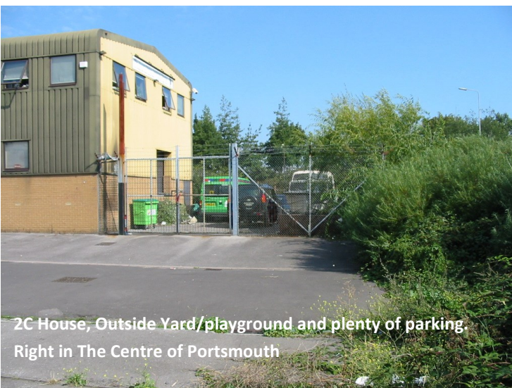
2C House, Outside Yard/playground and plenty of parking. Right in The Centre of Portsmouth

These are things that our children would never do without a push from us. One of the main projects we operate is a back to school scheme because many of our youngsters are completely disengaged and do not attend school very well,