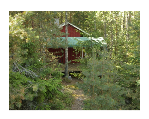
Set deep in the forest beside the Baltic Ocean the cottage is a wilderness experience for inner city children from areas like London, Birmingham and the Medway Towns.