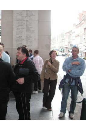
Battle Fields and The Menin Gate at Ypres was an education for the youngsters