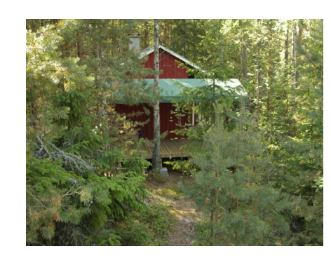
Set deep in the forest beside the Baltic Ocean the cottage is a wilderness experience for inner city children from areas like London, Birmingham and the Medway Towns.