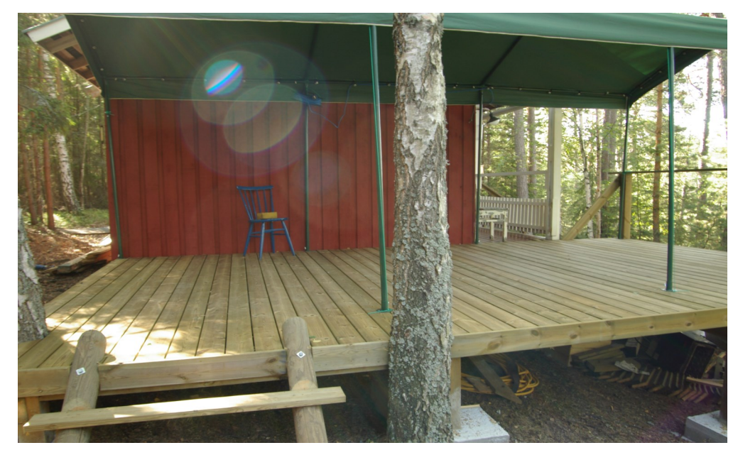
New Veranda Attached To The Cottage in Finland Built July 06