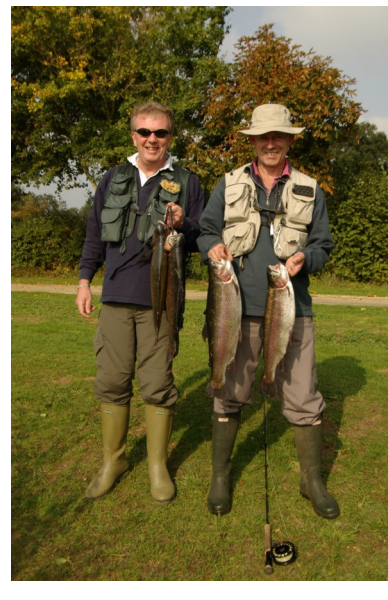
Dever Springs are great days fishing for Supporters and friends of Second Chance

Web Page: http://www.second-chance.org.uk