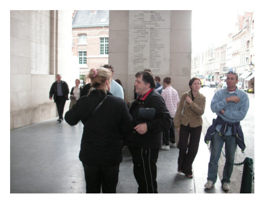
Battle Fields and The Menin Gate at Ypres was an education for the youngsters