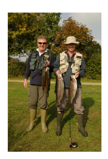
Dever Springs are great days fishing for Supporters and friends of Second Chance

Web Page: http://www.second-chance.org.uk