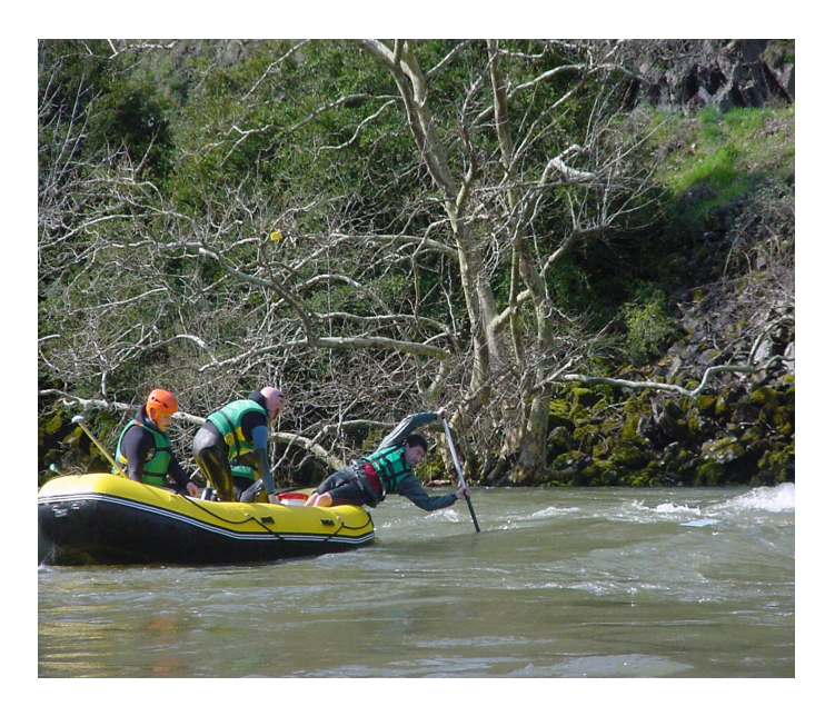
White-water Rafting Down The River Lot in France, March 2006

The youngsters learned a lot from their 'working parties'. It really emphasises how as a nation we are miseducating our youngsters. We have become so full of political correctness, guidelines and good practice that when it comes to the care and education of our young we have become guilty of neglect. We give the youngsters a false impression of what life is like. They have expectations beyond reality. They do not know how to do as they are asked, they believe everyone has a responsibility to them. They expect to start work on £40,000 a year, not to be ordered about, not to have to do anything they don't want. A huge chunk of our time as a Charity is spent educating the 16+ age group into what real life is all about. Some of our youngsters are unemployable when they leave school, not because they are stupid but because they do not know how to behave and what is reasonable to expect. Adults involved in young peoples lives are frightened to give the youngsters clear guidelines and parameters to work to; to teach them values and morals, to prepare them for real life. Common sense has disappeared almost altogether. Second Chance continues to do its best in redressing the balance.