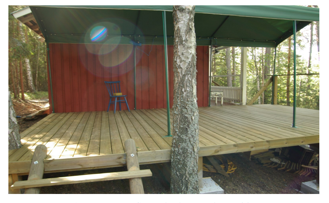
New Veranda Attached To The Cottage in Finland Built July 06