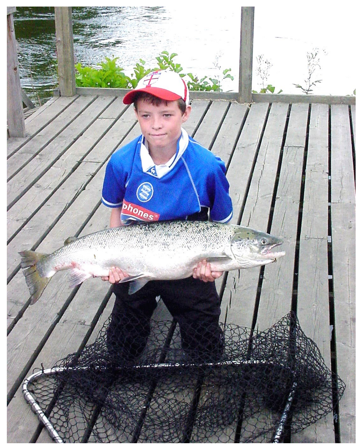
An Account Of The Project Undertaken By