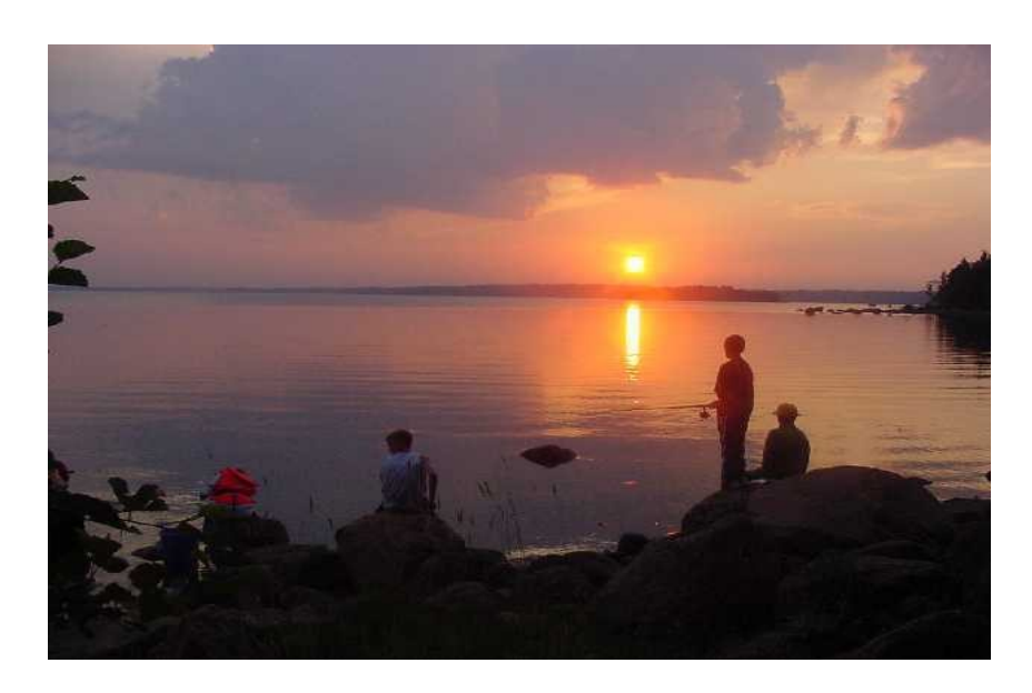
Our Youngsters Fishing In Front of The Cottage at 11pm - Could it get any better?