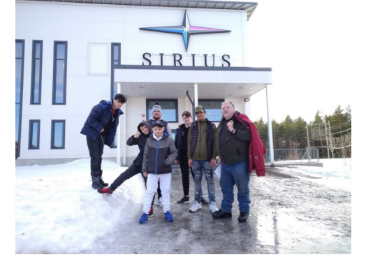
Temperatures shot up and it rained, so we adjourned to sports centre Sirius...