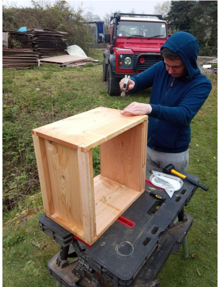
cause it shows a young man learning a new skill and helping the Charity at the same time by making a bee hive at our new Solent Nurseries site. He has a future.

ed opinions and our young peoples dysfunctional families we feel