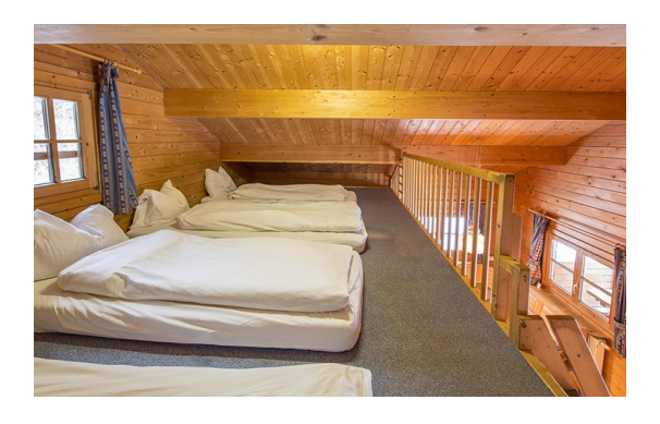
Residential accommodation onsite for the first time.

It will be a timber 'Log Cabin' style and will fit well into the environment. It will have a highish vaulted ceiling. The main room will be capable of seating 50 or so. At one end there will be a kitchen and dining area with a mezzanine floor over the top. At the other end of the main hall will be the showers and toilets, again with another mezzanine floor above. On these loft floors we will be able to sleep 5 children at each end on low beds, Scandinavian style, as we currently do with our cottage in Finland.