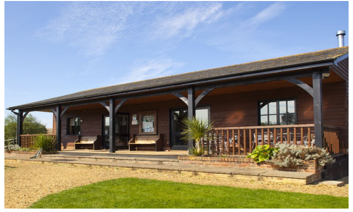
The Fishing lodge at Dever Springs fishery has been a useful model for us and ours will look very similar.

We already have our amazing facilities here; Nature Reserve, Farm, Camping and Fishing. We need this additional capacity to fully unlock these resources, both for more children and for longer periods, extending into the deepest of winter weather.