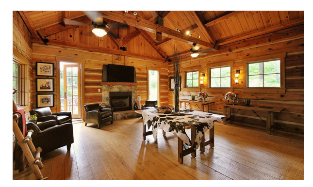
The inside will be something like this.