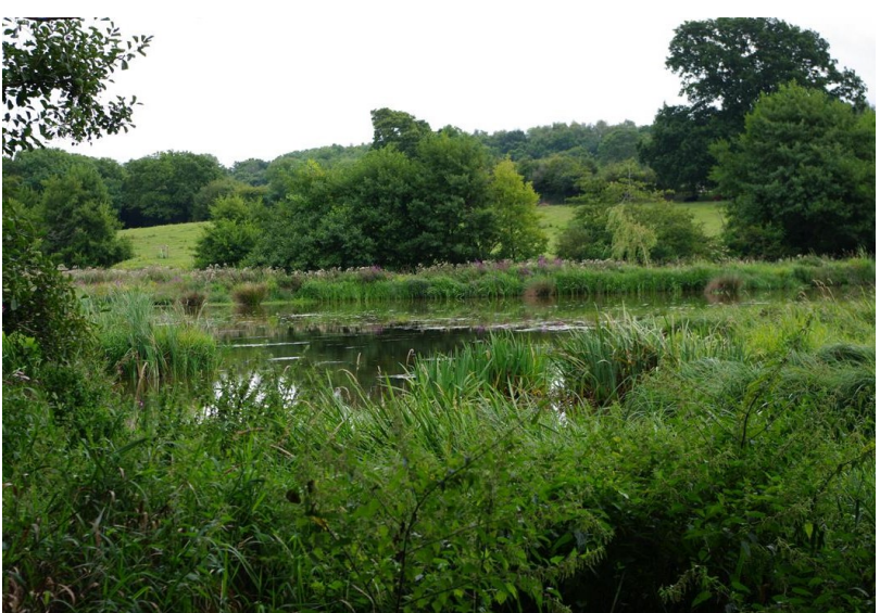
The view from the balcony.

This building will extend the range of activities we can undertake right through the year into the winter months when the tented accommodation is not practical. It could be we may get some income too from renting out the facility for conferences and meetings when the children are not using it. We intend to open up access to other groups who work with similar children. Under our guidance we hope to encourage a new and robust way of working with them, giving confidence to and disseminating good practice to their staff.