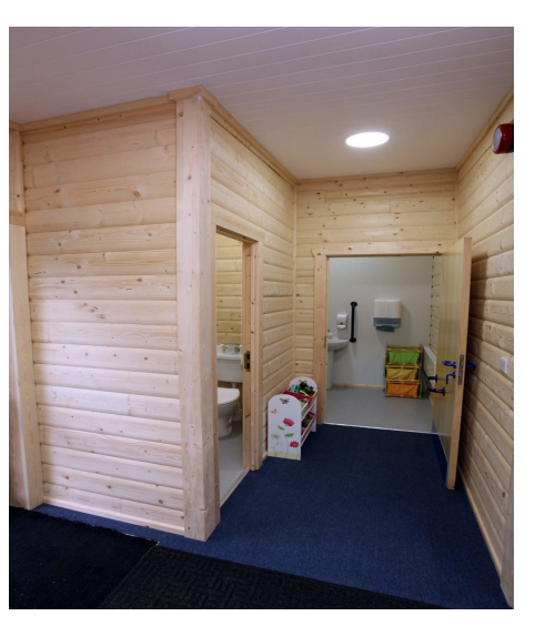
Toilets and showers below, beds above.

The Veranda will have a porch that will provide shelter to entertain and eat in the dry but still be outside and part of The Nature Reserve.