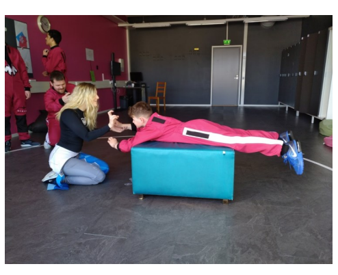
...where the boys were instructed and taught...