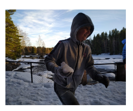
Endless snow ball fights beside a frozen river.