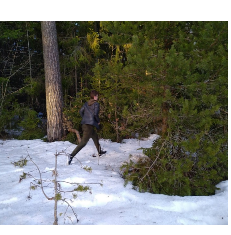
Chases in the snow filled forest.