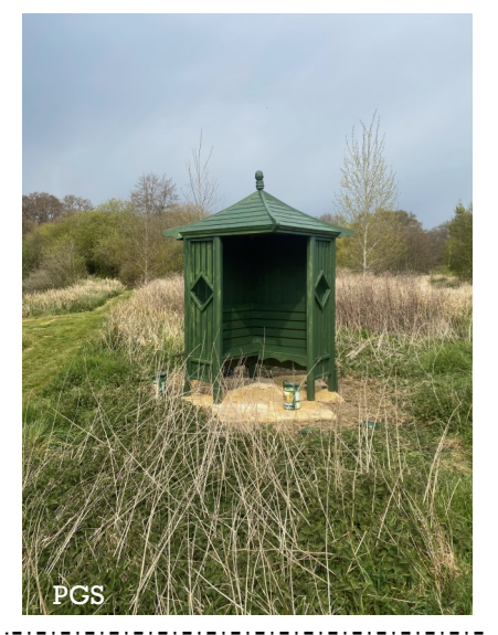
We built this fishing shelter next to one of our lakes this year.