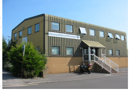
Second Chance House in Portsmouth. Portsmouth City Council have decided to charge us for not charging them!

years. It's especially unfair in that although they say they cannot afford to be discretionary we know of dozens of other charitable organisations in the city that don't get charged. Although the City Council tell us they are charging other charities we don't actually know anyone who is being charged! We house, free of charge, another charity in the city and would not dream of charging them or passing a charge on.. Do unto others and all that! Hence the headline about biting the hand that feeds it. We wonder if it would be better to pull out of Portsmouth and just transport the children we are working with to our Rural Centre where Winchester City Council honour and help us.