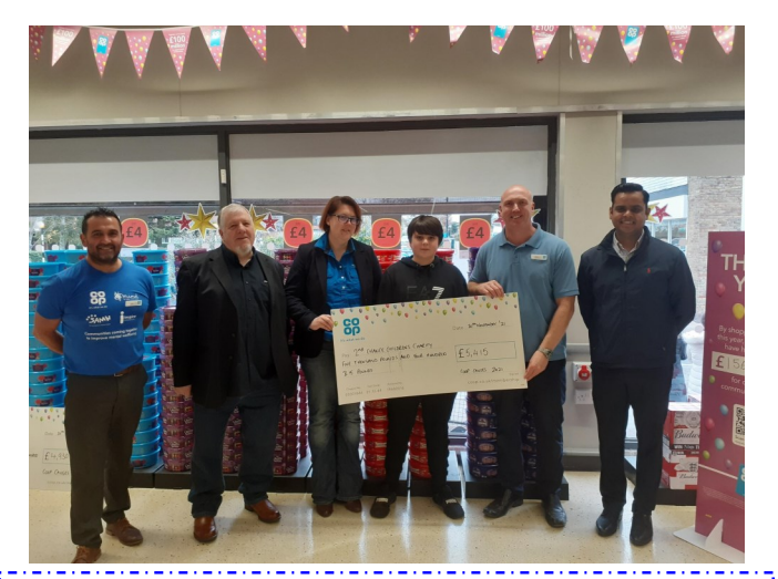
Our Local Co-Op Stores Raised £5,415. Here is the presentation in The Highland Road store in November.

Thanks to Wave 105 , the local radio stations Christmas Appeal, we had bundles of presents for our underprivileged children at Christmas.