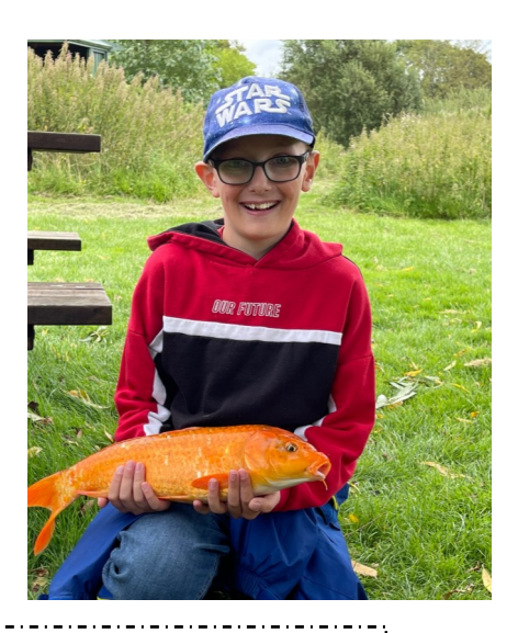
Some random pictures of children catching fish from our lakes—life changing for many of them.