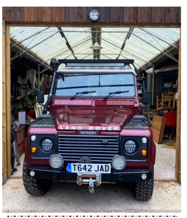
Our 'Finnish' Land Rover has sat, sadly, in our store in Hampshire gathering dust for almost 2 years now.

Sadly, for the second year running, our cottage remained empty. Even when the travel bans were lifted the conditions requiring tests and inoculations and stuff made it in practicable to take the children to our beloved cottage in Finland. However at the beginning of November both The Finnish and British Governments made changes to travelling and arriving that look like it may be possible to once again resume visits. We are thinking of taking a single group of 7-10 boys in February 2022 to experience Finland in the winter! Providing climate change allows us we intend to show them what a Finnish winter looks like; frozen sea and minus temperatures and all the snow they can chuck at each other! Hopefully next years report will contain many photos of both winter and summer activities at our cottage. We really hope