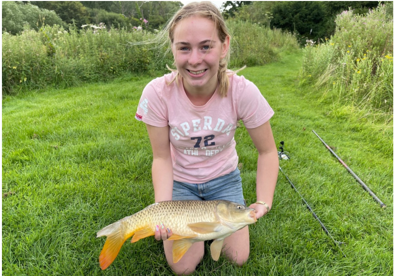
The summer season was great for catching fish in our lakes..

People rarely believe us when we say how fishing can change lives. Sounds trite but it isn't!