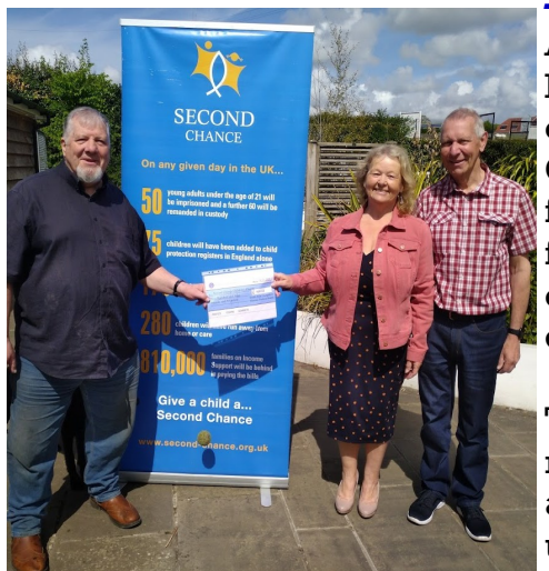
South East Hampshire Masons Festive Board.

As we predicted last year, this year has been the problem year. During the initial period of lockdown in 2020 we had access to government grants and local authorities (but not Portsmouth City Council who refused our applications). This made up for the shortfall in individual donations and for the normally supporting trust funds that strangely directed their giving to other pandemic related needs despite our work amongst the vulnerable actually increasing as a response.