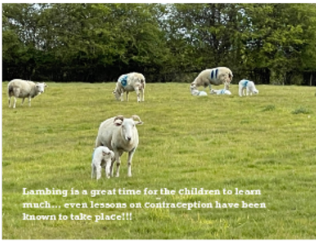
Lambing is a great time for the children to learn much... even lessons on contraception have been known to take place!!!