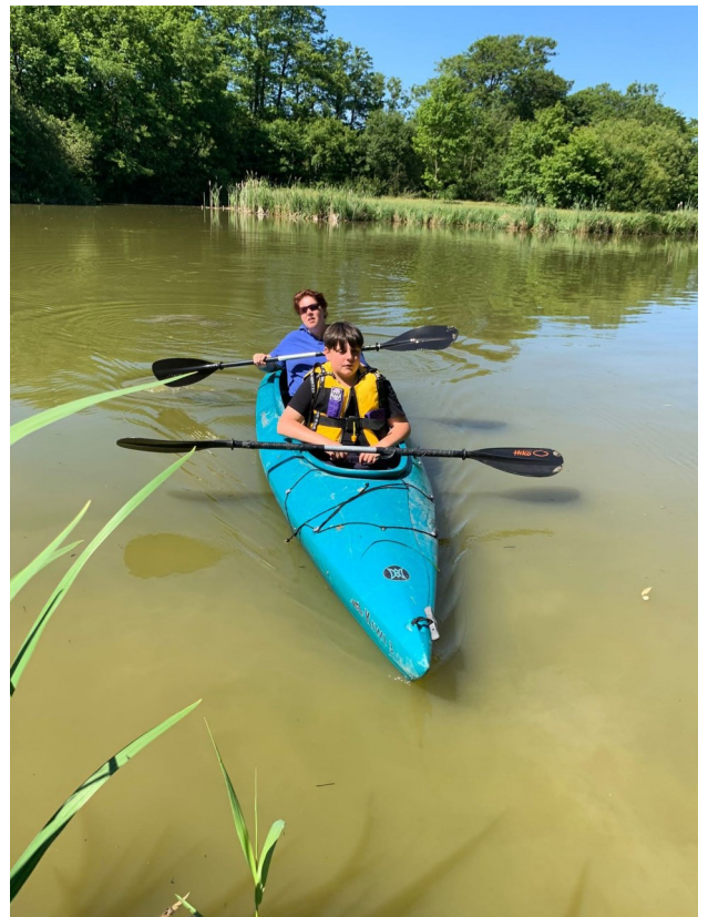
Canoeing on our largest lake was popular during the summer holidays.