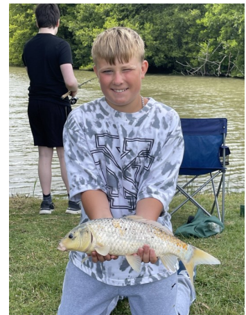
Same day, 3 fish, 3 boys, 3 smiles. Success makes such a difference in all our lives!