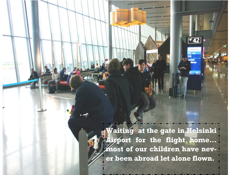
Waiting at the gate in Helsinki Airport for the flight home... most of our children have never been abroad let alone flown.