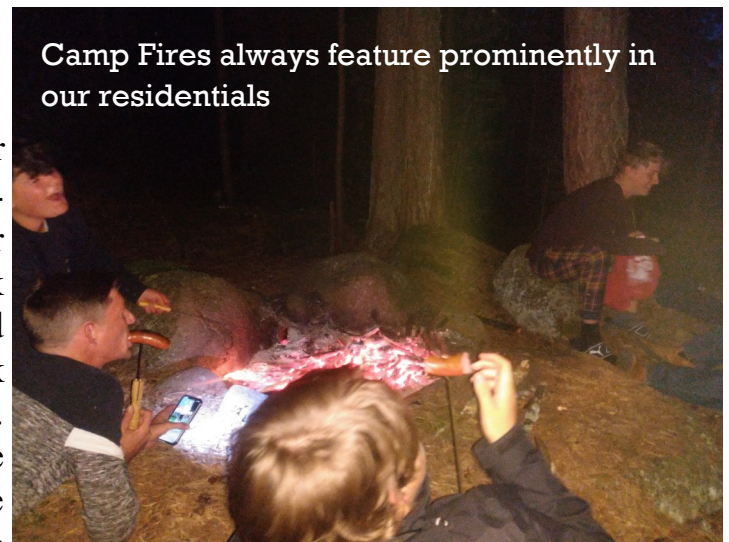
Camp Fires always feature prominently in our residentials

Finland 2022 We are glad to report that after almost three years of travel restrictions and lockdowns we finally opened the cottage up to our youngsters again this year. The only draw back being that the airfares have increased hugely and will limit our future use if they don't fall back to pre-pandemic levels before next summer. Because of these difficulties we didn't manage any winter trips this year but are planning some for February next year when we hope to take the