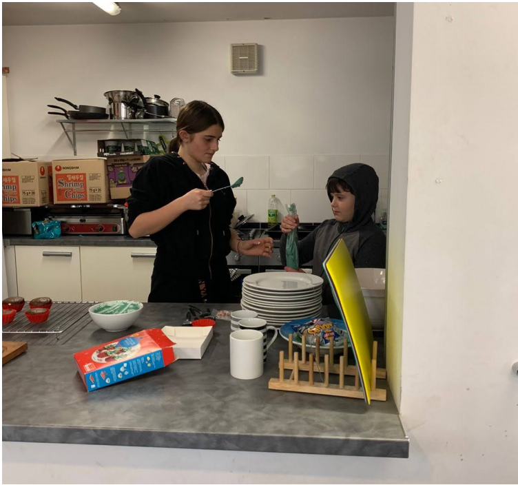
Cooking in our kitchen. Producing meals and treats for everyone is part of the preparation for life as adults.