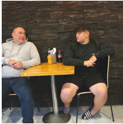
Eating together gives the staff so many opportunities for teaching.