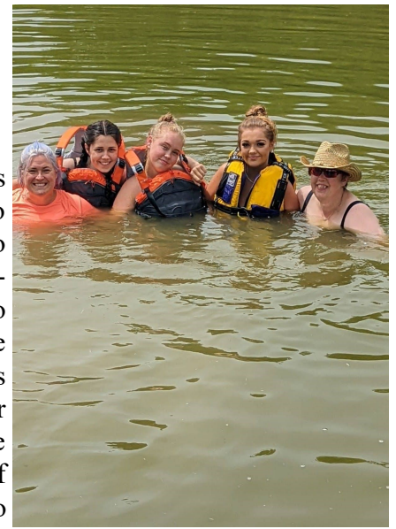
Cover Picture. What a scorcher of a summer we had. Hosepipe bans and 40 degree heat but there was always one of our lakes to plunge into to cool off - a welcome relief.

I am so pleased to welcome you to our latest 'end of term report'. This year has proved interesting for us. While we have seen 3 Prime Ministers come and go and the cost of living sky rocket we have maintained a steady ship here. Glad to see the back of the lockdowns we forged ahead and had a great summer of activities in the scorching heat of the UK's record breaking heatwave. I am so pleased we finally recommenced our residentials at our cottage in Finland, we have missed the place during Covid restrictions. It had to be a limited use this year because the price of air tickets has rocketed. This seems to be a feature for everything at the moment. With food and energy prices soaring our families are often amongst the most impoverished to start with so you can imagine some of the challenges we have faced in the latter half of this year and don't expect it to get better for 2023 either.