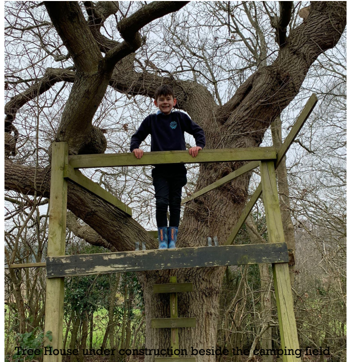
Tree House under construction beside the camping field