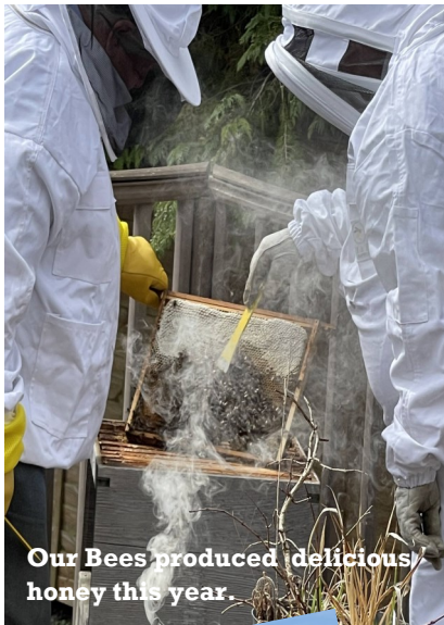
Our Bees produced delicious honey this year.