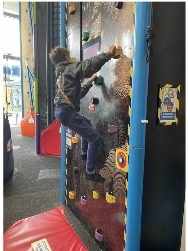
Action shot 'Rock Climbing' ... Great for building confidence as well as expending energy!!