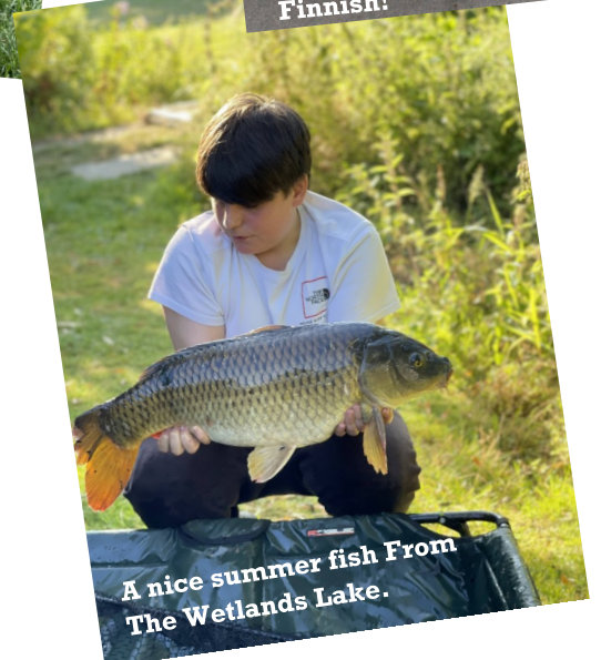
A nice summer fish From The Wetlands Lake.