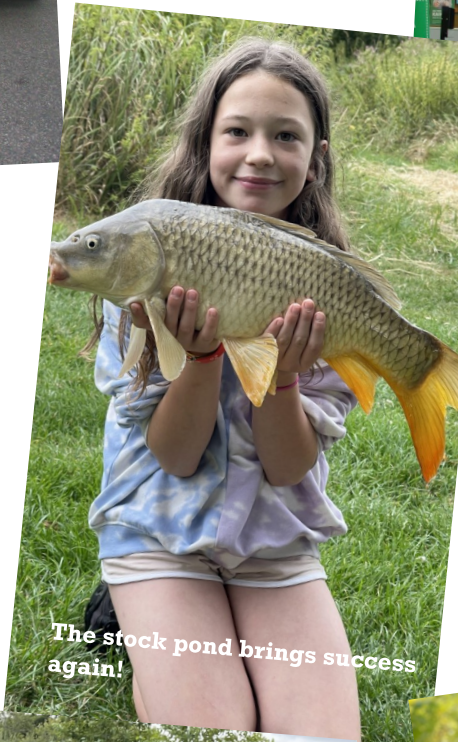
The stock pond brings success again!