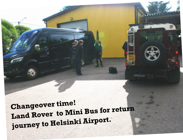
Changeover time! Land Rover to Mini Bus for return journey to Helsinki Airport.