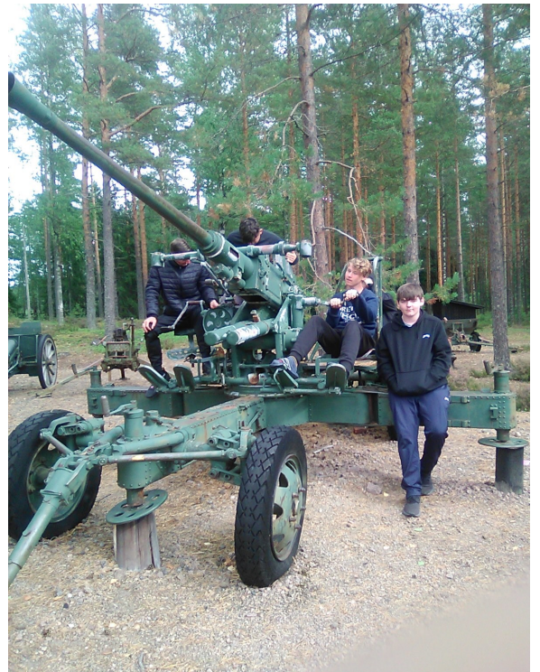
We visited the 'Bunkeri' museum on the Russian Border. Timely discussions as the Russians did their worst in Ukraine.