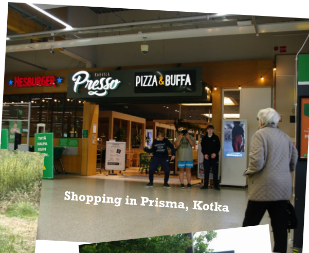
Shopping in Prisma, Kotka