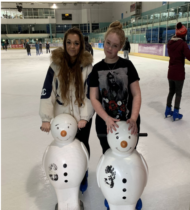
Ice Skating can take many forms!