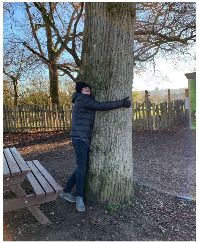
'Tree Hugging' is not on the curriculum but if you feel the urge.... !