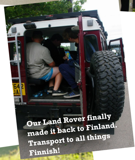
Our Land Rover finally made it back to Finland. Transport to all things Finnish!