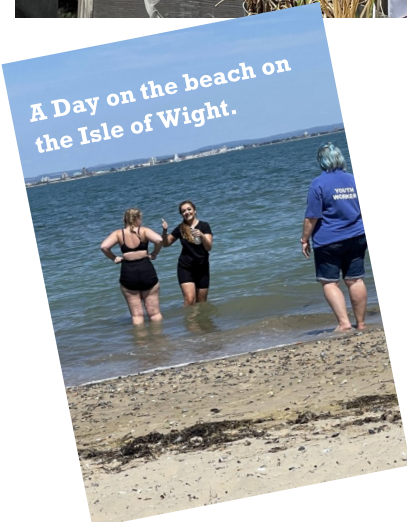
A Day on the beach on the Isle of Wight.