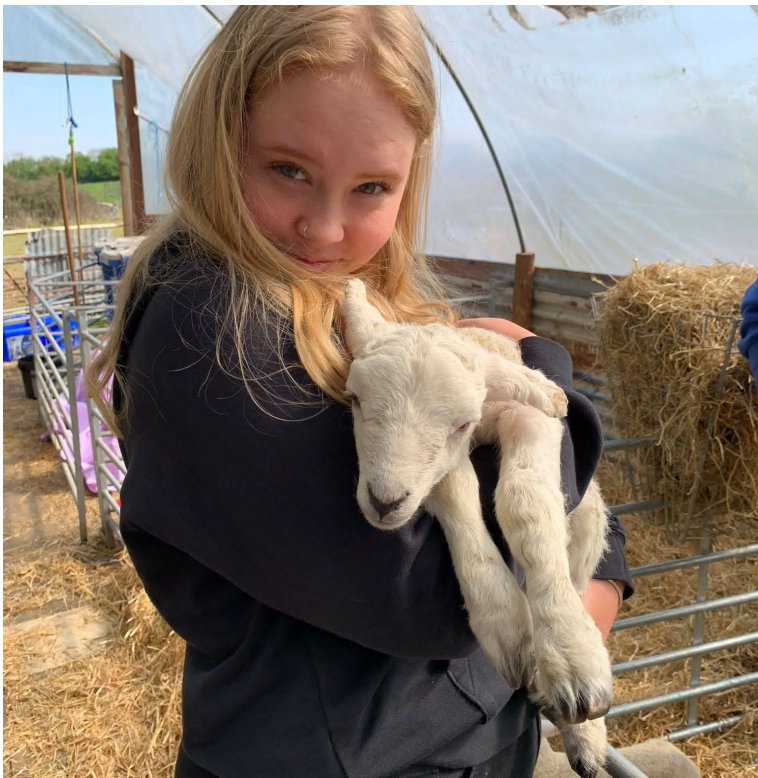
Lambing went well on our Rural centre this year. A biological education for many of the young people!