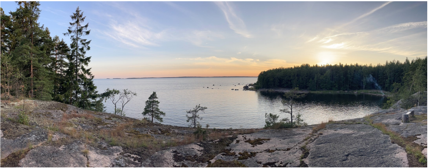
The view from the top of our 'garden' in Finland. Taken in July this year!