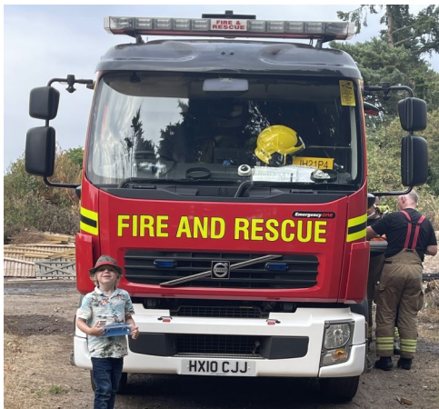
While we were in Finland we had a fire at our Rural Centre. We are grateful to the Fire Service for prompt attendance. We did lose our tractor shed though!